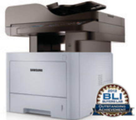
Outstanding Achievement in Innovation: Samsung Easy Eco Driver